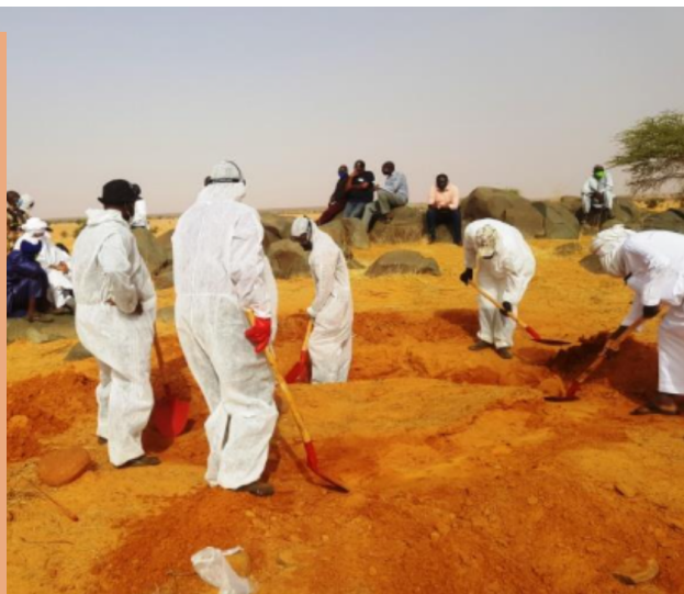
One of the six mass graves discovered in Inates, Niger, in 2020

Healthcare worker, arbitrary detention and torture survivor, Niger.