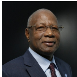
Pr. Abdoulaye Bathily (Senegal) former Deputy Special Representative of the UN Secretary General for Mali former minister historian